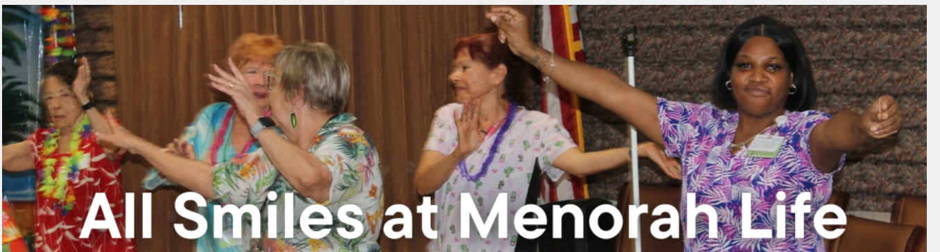
All Smiles at Menorah Life