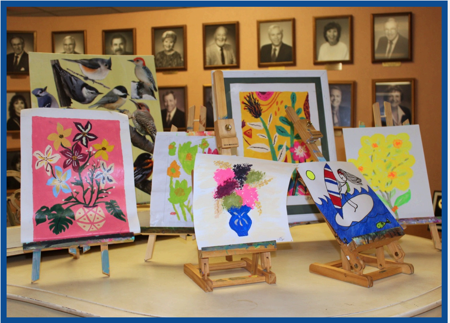
Artwork created by Menorah Life residents

“Creativity is contagious, pass it on.” — Albert Einstein